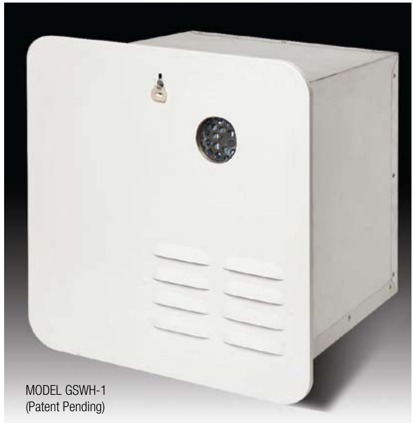
MODEL GSWH-1 (Patent Pending)